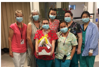
Delivering a hamper to the NICU nurses at GCUH

SCC and The Mooring are so grateful for the help from our sponsors, Commbank and MPM Property, for helping with the massive task of putting the hampers together!