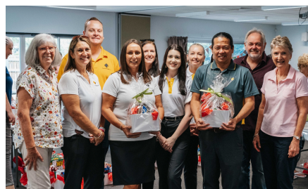
Hamper packing with a team from Commbank