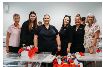
Hamper packing with a team from MPM Property